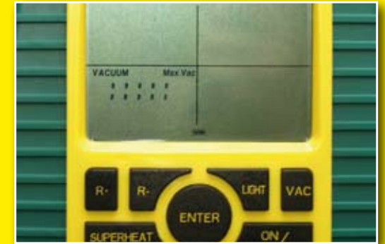
Indicative bar graph display